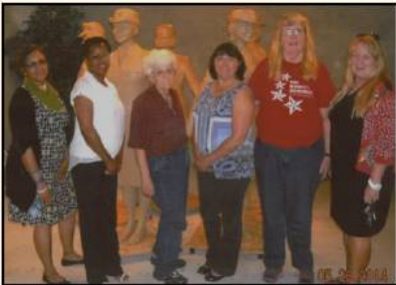
Group picture on one of the visit to Luther, OK