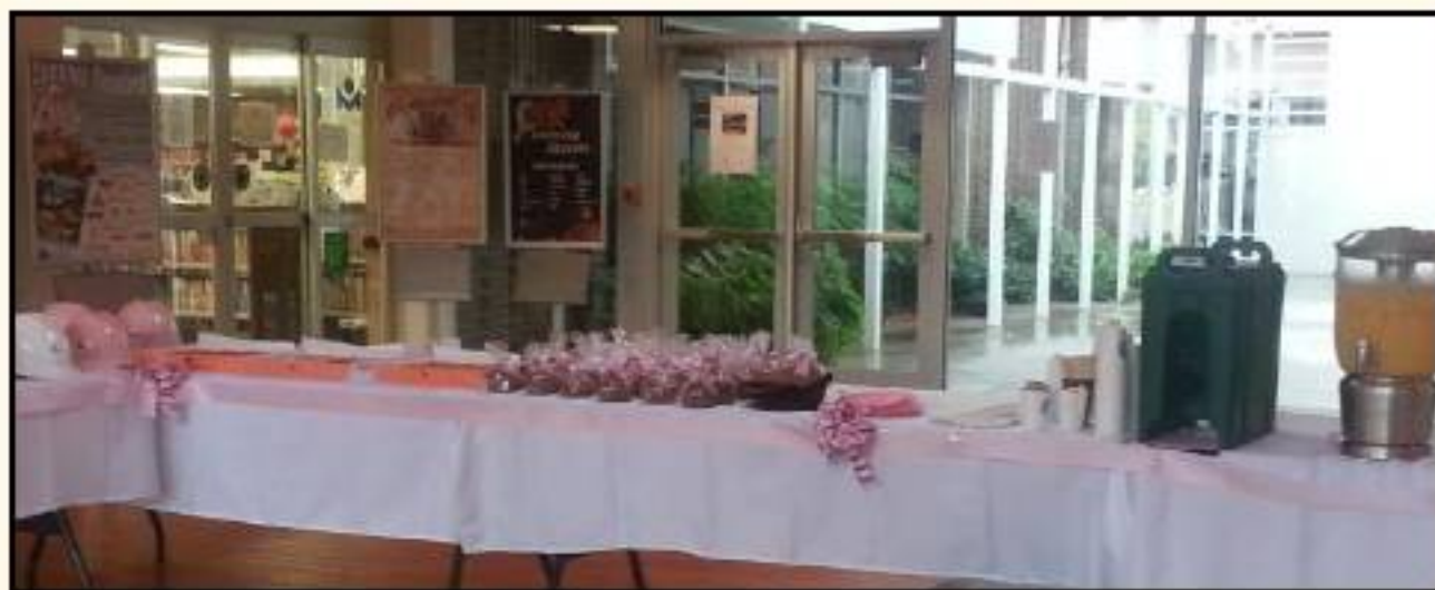
Refreshments and setup for groundbreaking