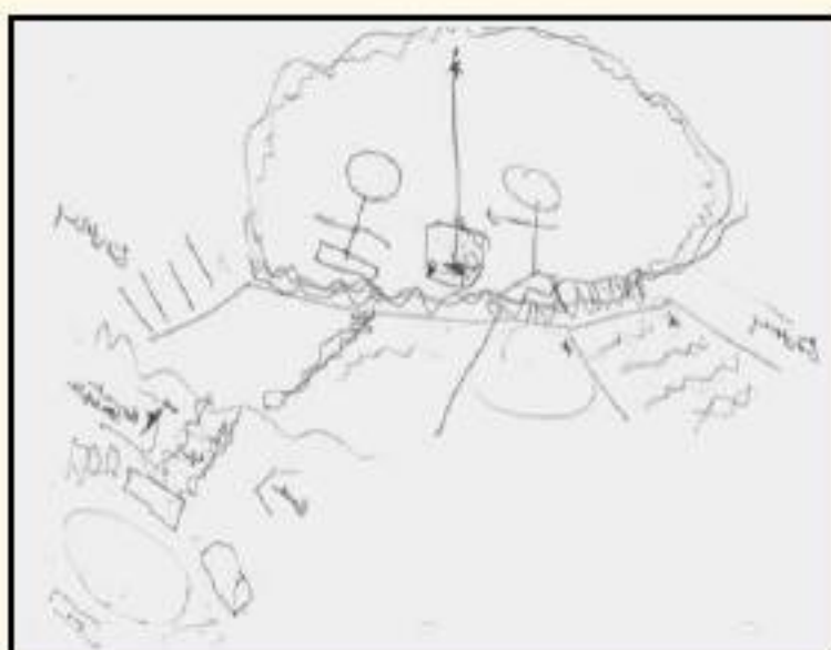
Drawings created in the planning stage